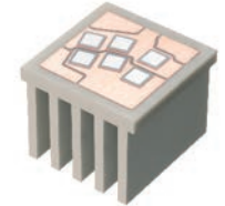
Chip on Heatsink®