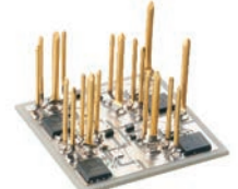
Pin Heights can change