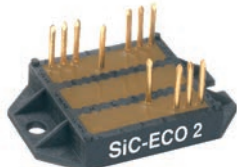
9 mm Height SIC-ECO 2®