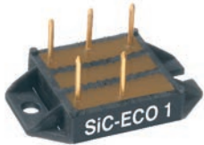
9 mm Height SIC-ECO 1®