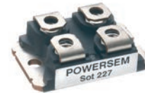
12 mm Height with Baseplate, Sot 227