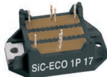
17 mm Height Eco-Press-Fit®